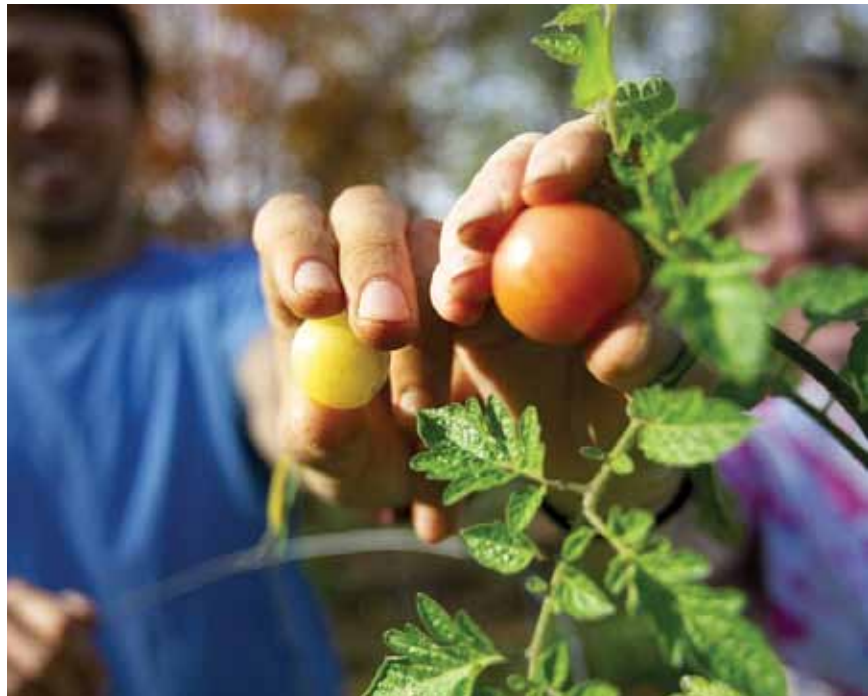
Connecticut College's Sprout Garden, a sustainable food initiative

In 2004, Connecticut College students decided to implement a mandatory $25-per-student fee to support the establishment of renewable energy on campus. This visionary gesture was hindered by high costs, which prevented direct investment into on-campus, renewable energy systems. Instead, these funds paid for feasibility studies and the purchase of Renewable Energy Certificates. In an effort to use these funds to support a wider range of sustainability projects, the Student Government Association voted to transform the Renewable Energy Fund into a Student Sustainability Fund. The annual fee will now support a wider range of projects that foster a holistic vision of