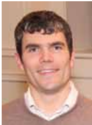
Professor Derek Turner

HUMANS interact with other animals in a variety of different ways and contexts: We keep them as pets; we form lasting relationships with them; we hunt them; we keep them in captivity;