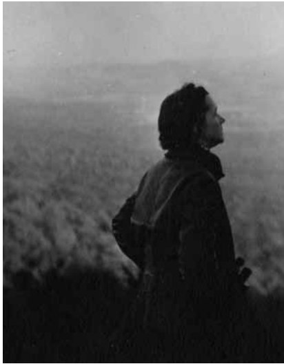
Rachel Carson watches raptors on Hawk Mountain in 1946.