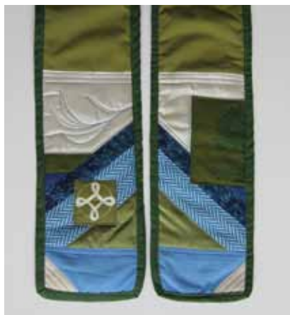
Custom sashes for the center's recognition ceremony scholars